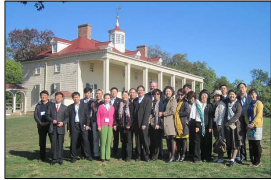
CCCWA Delegation at Mt. Vernon, home of President George Washington October 2012