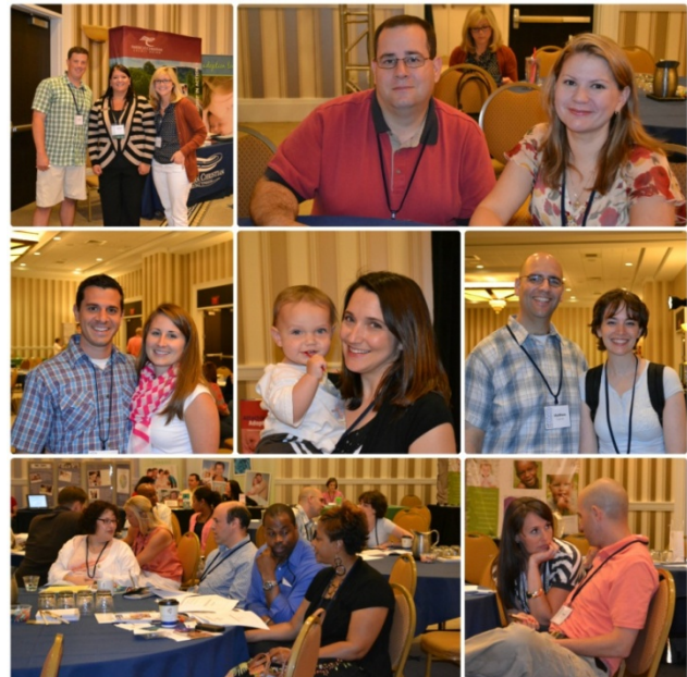
Attendees at Prospective Adoptive Parents Day enjoying the days sessions June 2012